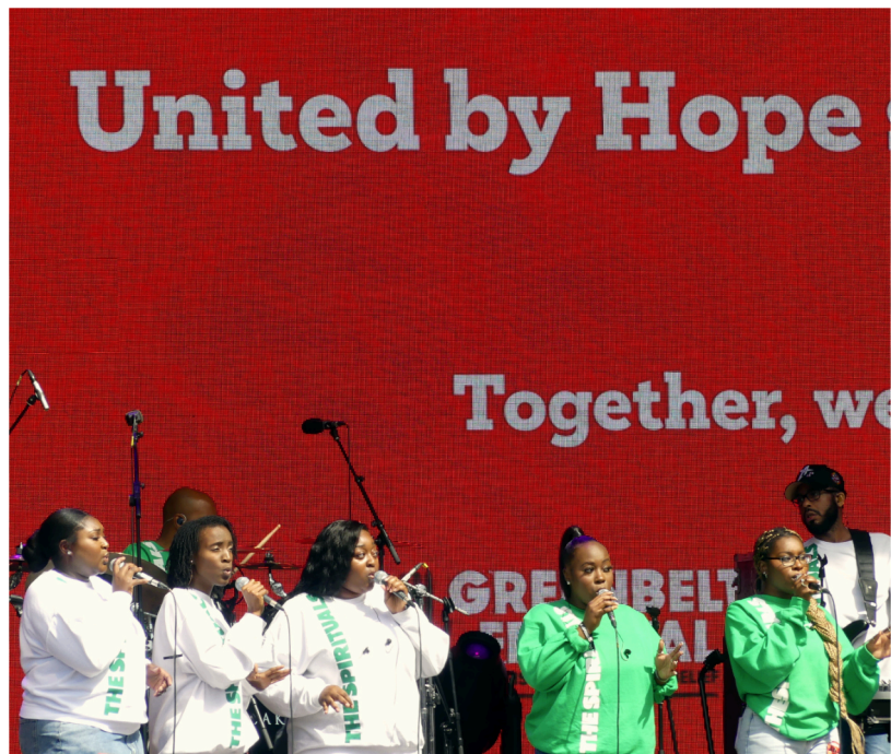
Greenbelt 2023 © Jane Canning