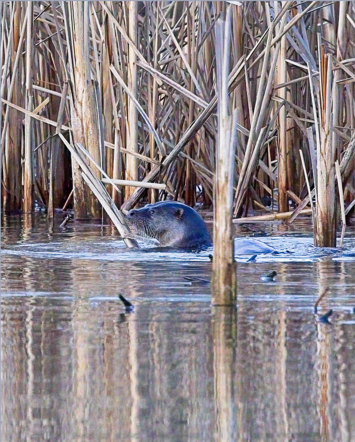
Otter at Backwell Lake