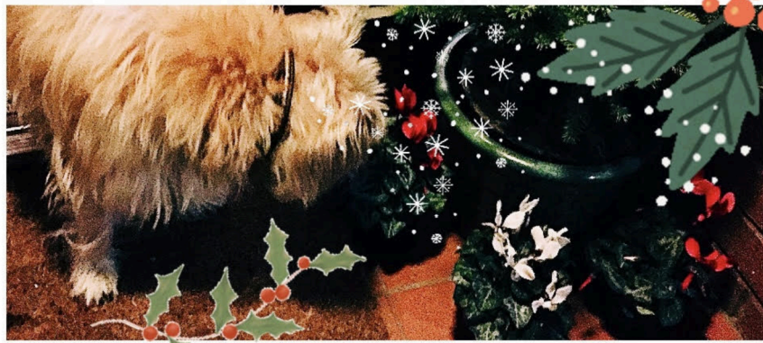
showing how an app or two can add a touch of festive cheer to your photographs

"I CAN'T FIND ANY PRESENTS ROUND THIS TREE!!!"