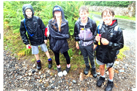
The team smiling despite the rain